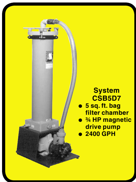
System CSB5D7 ● 5 sq. ft. bag filter chamber ● ¾ HP magnetic drive pump ● 2400 GPH