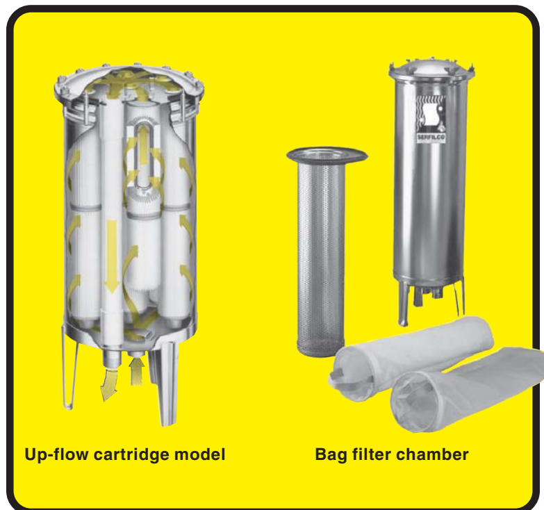
Up-flow cartridge model

The threaded inlet and outlet connections are conveniently located vertically at the vessel's lower end. Thus, piping can be of any orientation. All vessels are designed for 9 3/4" long filter cartridges (or multiples thereof). These cartridges are available in cleanable pleated polyester or most depth types.